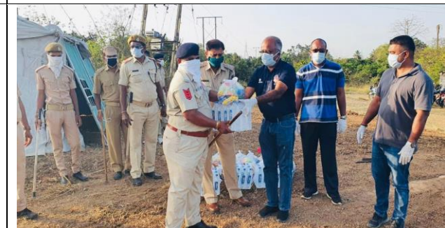
COVID-19 RELIEF TO POLICE DEPARTMENT