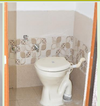
All the above houses are furnished with tiles and sanitation facilities