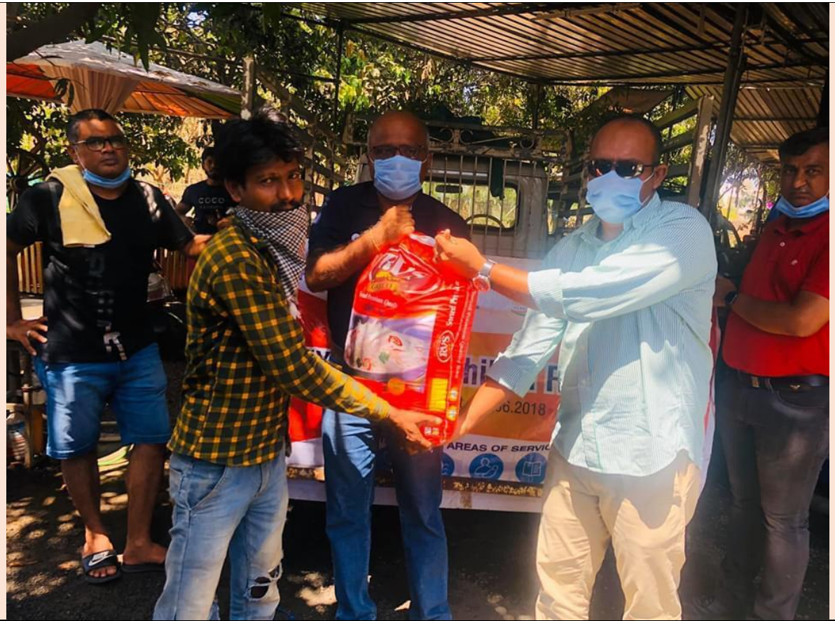
RC CHIKHLI RIVER FRONT TEAM IN ACTION