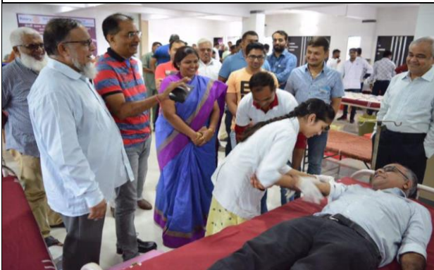
PRESIDENT DONATES BLOOD