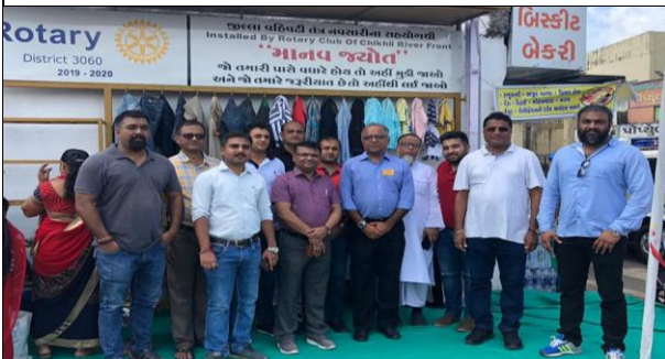
MANAV JYOT INAUGURATION