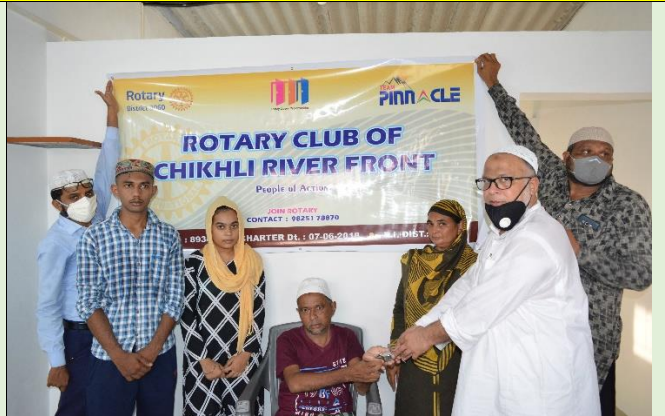
A house was built for a Homeless Paralysed Patient and his family of 4 members in Dabhel