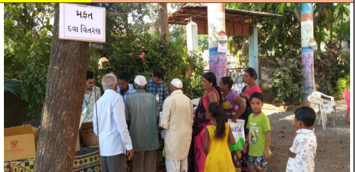
GENERAL MEDICAL CAMP IN SIYADA