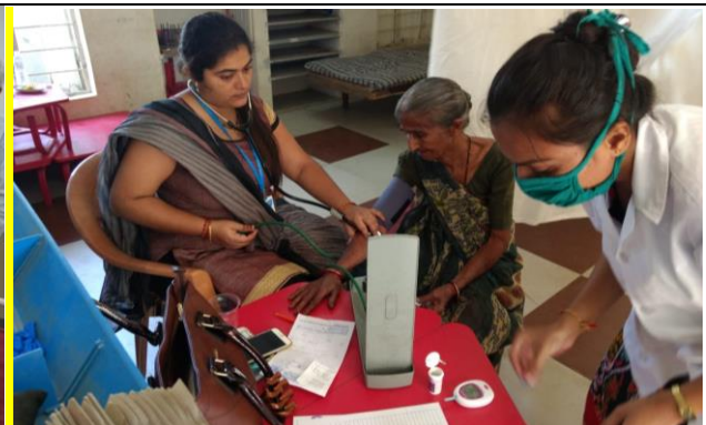
DR CHECKING UP AN ELDERLY LADY