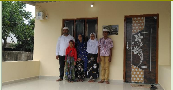
A Homeless family of 6 members were given a newly built house in Mahudi Village, District Navsari